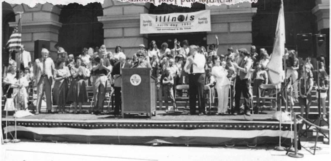
Earth Day celebration at the State Capitol.