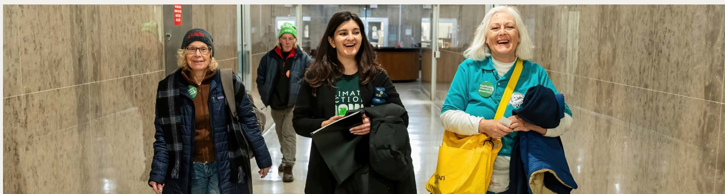
Illinois environmentalists walk through the state Capitol from one legislator meeting to another.