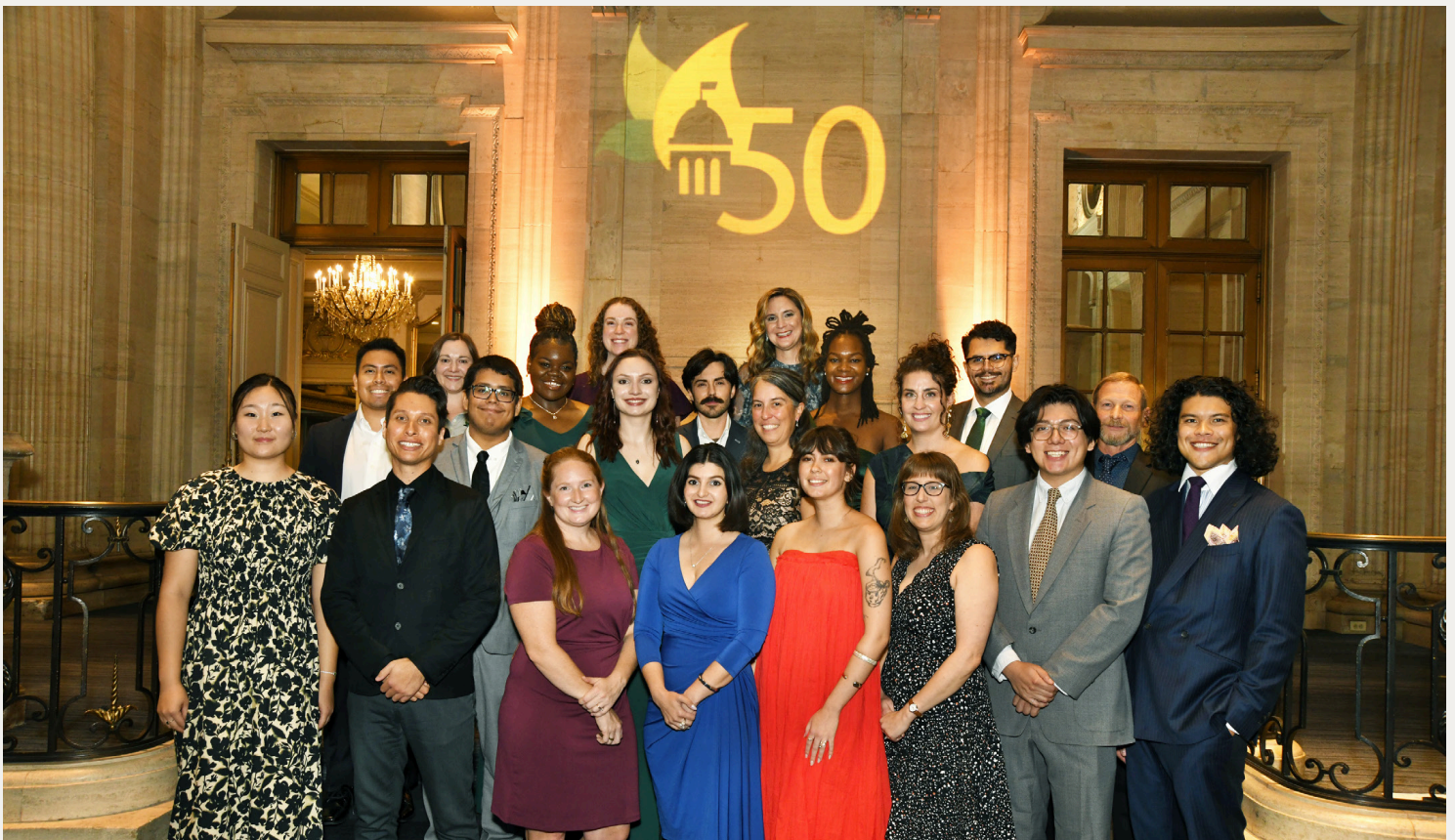
IEC Staff at the IEC 50 th anniversary Environmental Leadership Dinner.